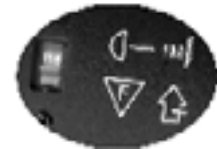
AC Voltage Switch Example

To determine the power requirements for a particular product, see the label affixed to the back plate of the product or refer to the product's specifications chart. A product's listed current rating is its average current draw under normal conditions. All fixtures must be powered directly off a switched circuit and cannot be run off a rheostat (variable resistor) or dimmer circuit, even if the rheostat or dimmer channel is used solely for a 0% to 100% switch. Before applying power, check that the source voltage matches the product's requirement. Check the product or device carefully to make sure that if a voltage selection switch exists that it is set to the correct line voltage you will use.